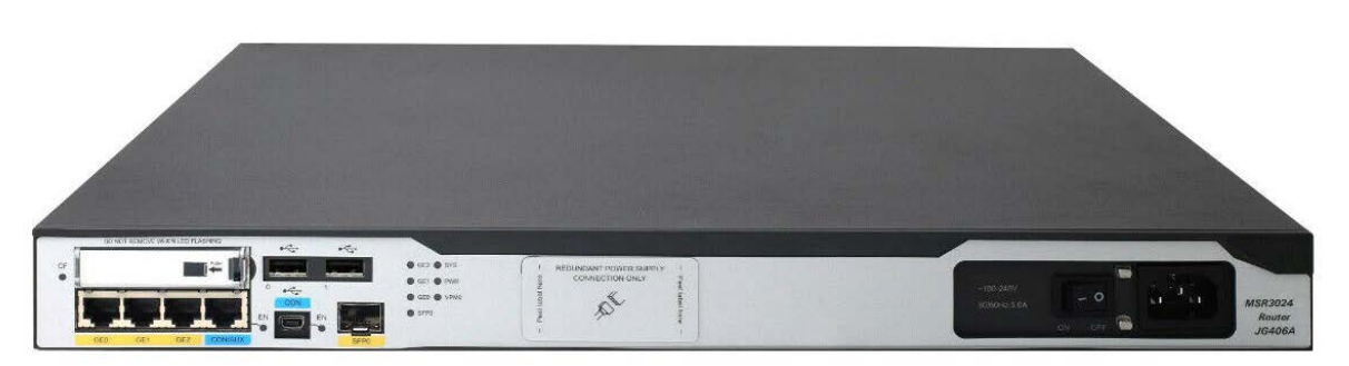
HPE FlexNetwork MSR3024 AC Router - Front