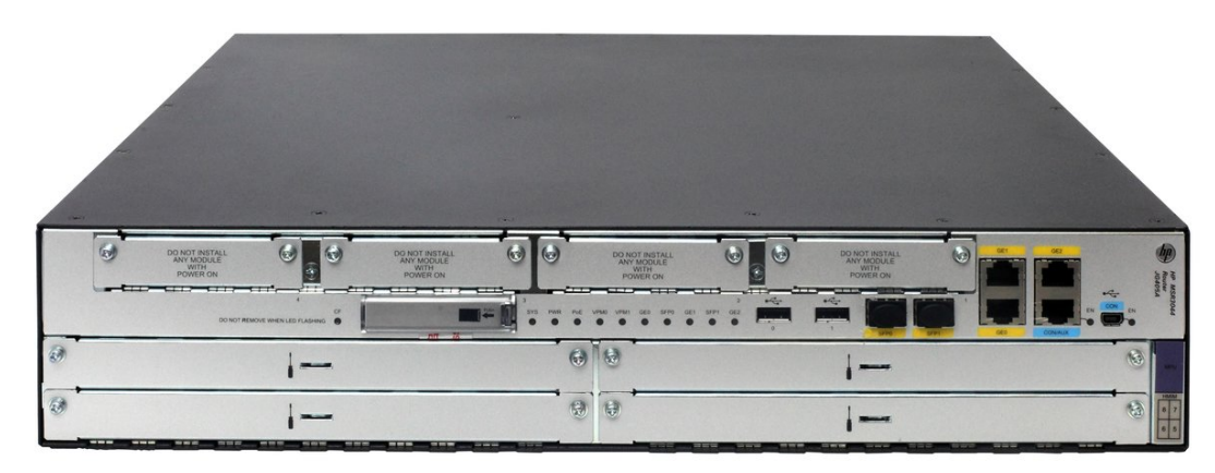
HPE FlexNetwork MSR3044 Router- Front