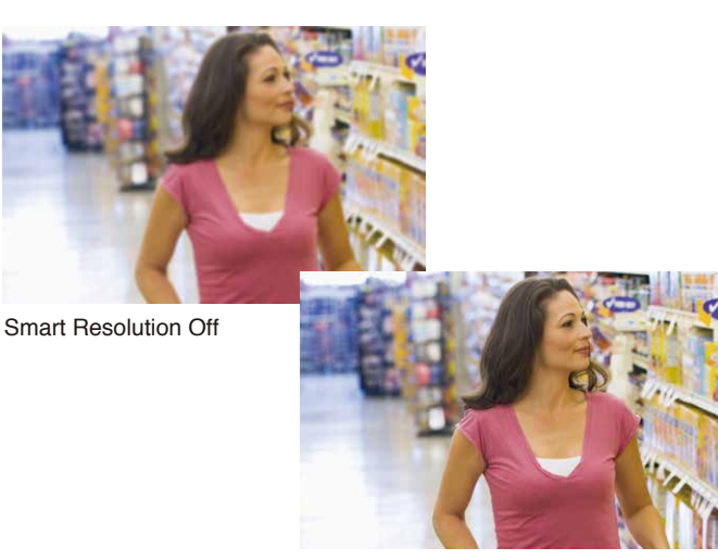
Smart Resolution On

Smart Resolution blur-reduction technology analyzes the displayed content and ensures that noise is not accentuated while correcting blurred areas for a sharper, clearer image. For images with a great deal of depth, it sharpens the foreground more strongly to maintain a real world sense of focus.