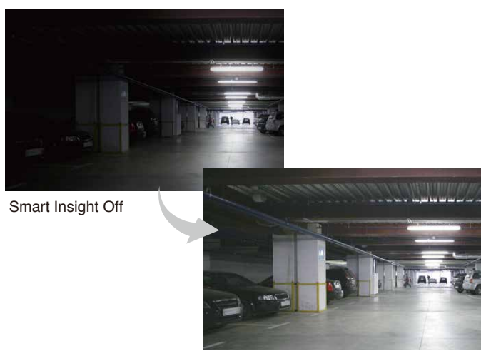
Smart Insight On

Smart Insight visibility-enhancing technology automatically detects areas that are dark and difficult to see by adjusting the brightness of each pixel, brightening images while reproducing them with a realistic sense of depth. Areas that are difficult to see due to low ambient lighting are enhanced for increased visibility.